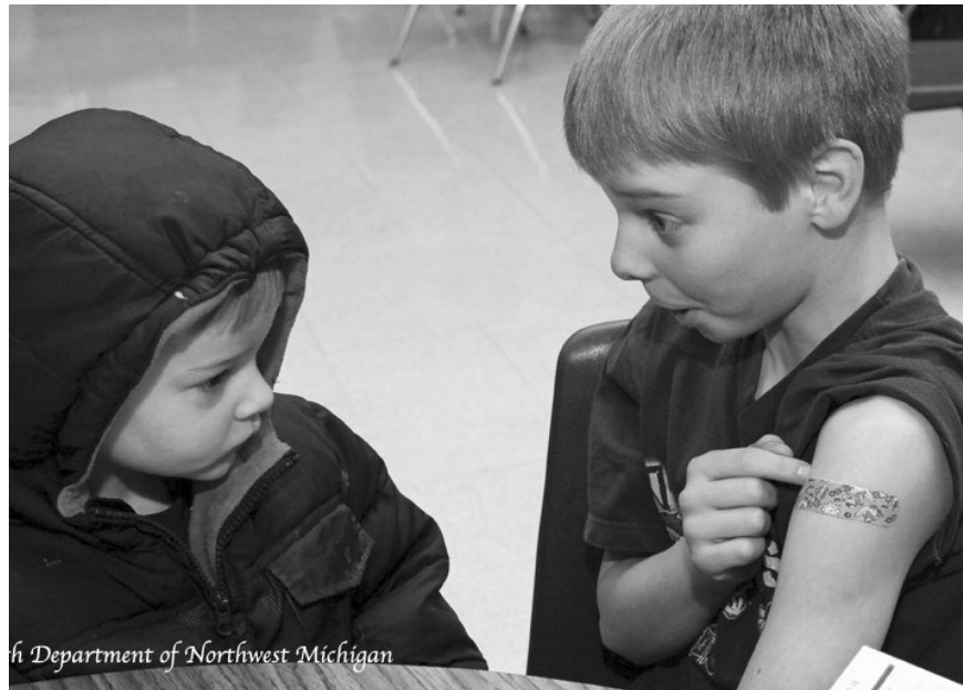
Department of Northwest Michigan