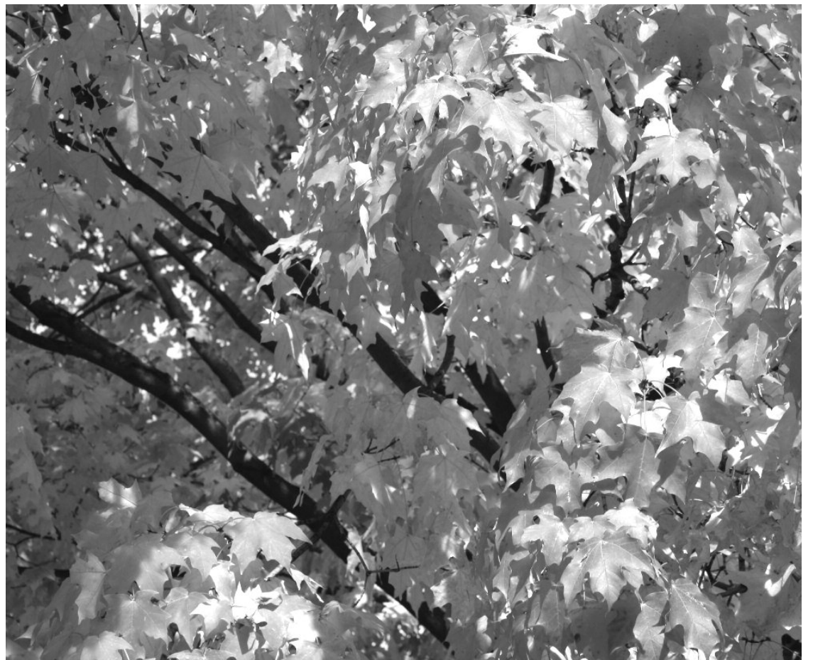
Although every season holds its own distinct feature during this scenic route, fall is the time when the drive shows off its true colors.