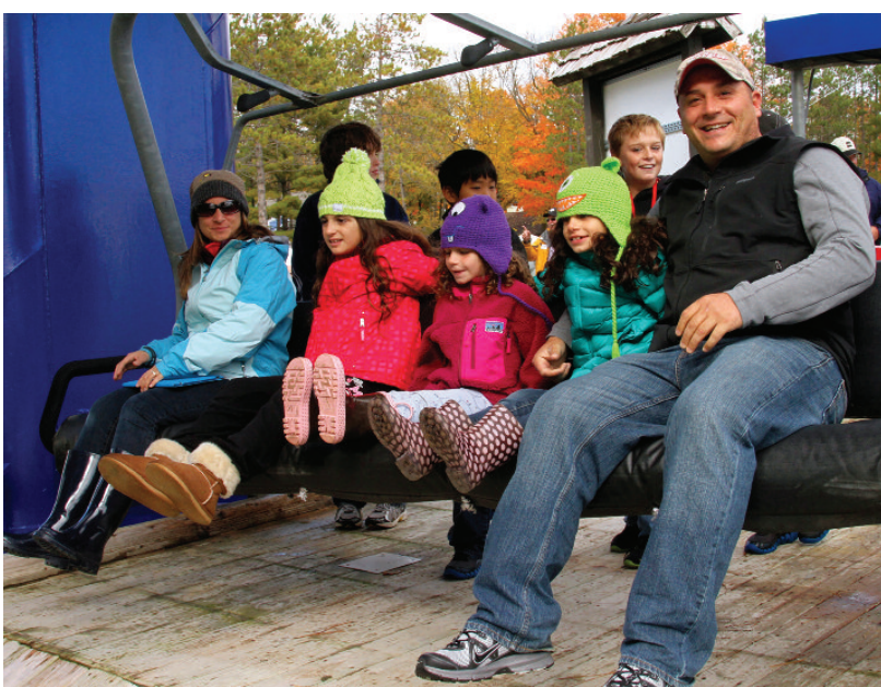
Boyne Mountain Resort has been a favorite Midwest destination since 1948.

Michigan's largest indoor waterpark, Solace Spa, Zipline Adventures, two golf courses, disc golf, lift-served mountain biking, beach activities, kids programs, lodging, meeting and wedding facilities and real estate.