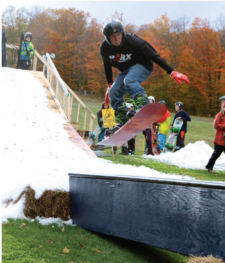
Boyne Mountain plans to expand its attractions for this year's festival of events, so come out, have fun and make next weekend a trip to remember.

Boyne Mountain Resort has been a favorite Midwest destination since 1948. The family-owned, four-season resort has earned Certificates of Excellence from TripAdvisor, been recognized by Conde Nast Traveler readers among the Top 50 Best Places to Ski and Stay in North America, and has been named a Top 10 Indoor Waterpark by Budget Travel and Readers' Choice Favorite from Spa Magazine. Boyne Mountain offers 60 runs on 415 skiable acres, cross country skiing and snowshoeing,