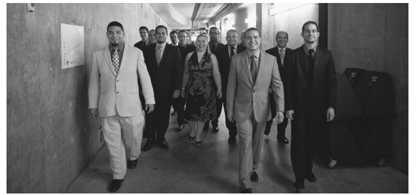
CalJe will perform at Boyne City Performing Arts Center

atre's 'The Ugly Duckling' & 'The Tortoise and the Hare' at Boyne City PAC